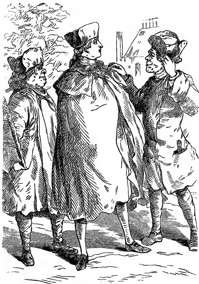
A Pair of Old Acquaintances.